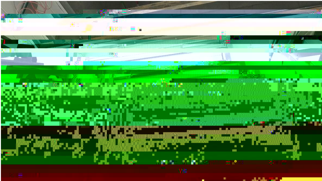
Mechanical Exhaust adjacent opposite wall of main entrance