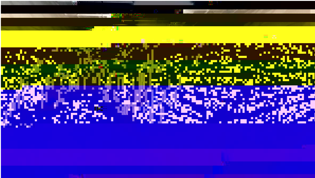
Corridor paint complete, ceiling grid is fastened with light fixtures in place and ready for Chapter (1) above ceiling inspection. Fire Alarm wire pull thru conduits in E, F, G areas are current.