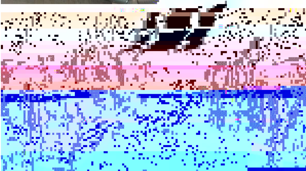
Area view in secondary entrances porch and common traffic where light fixtures packages are stored