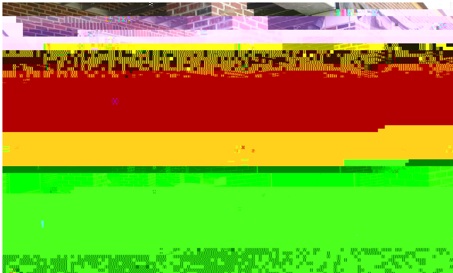
West Elevation entrance see doors and masonry brick veneer are placed and ready for cleaning