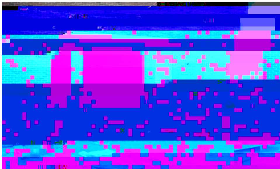
Typical Masonry Veneer with accents and window system