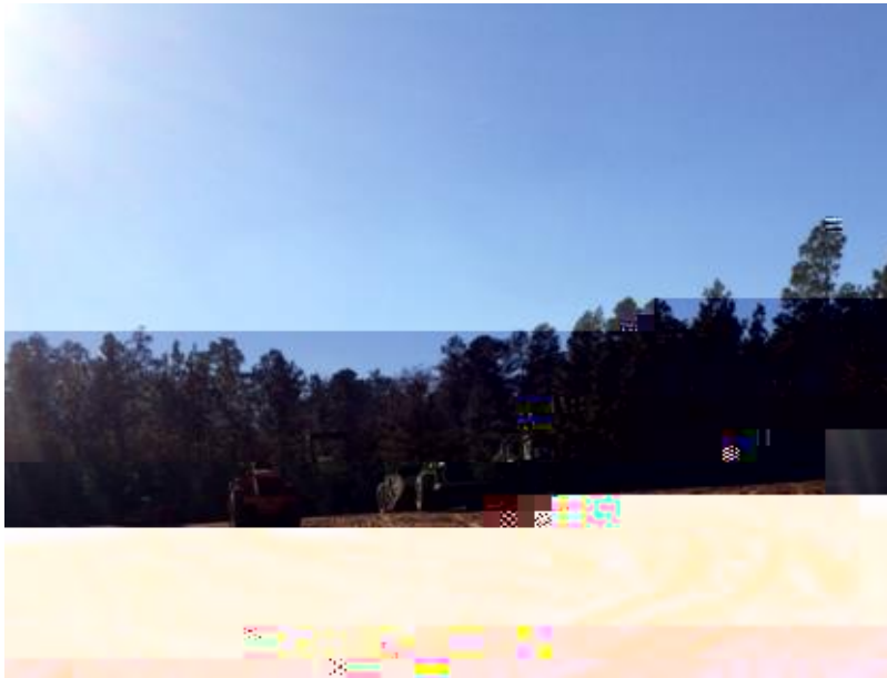
Lifts & Compaction West side of site