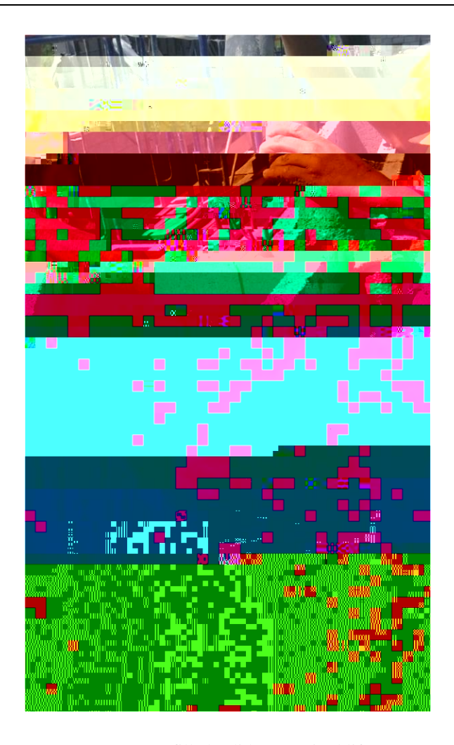
CMU grout filled solid @ required lifts

Construction Management @ risk HG Reynolds PROJECT NO.: