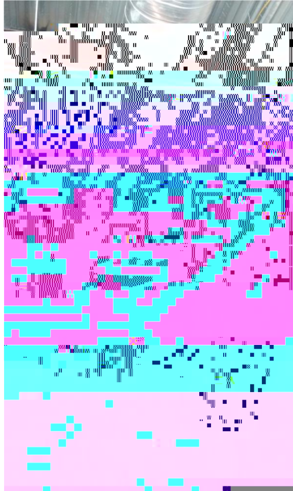
View of Duct work install, seal and water lines as well as electrical JBoxes

CONTRACT: Construction Management @ risk ARCHITECTS HG Reynolds PROJECT NO.: