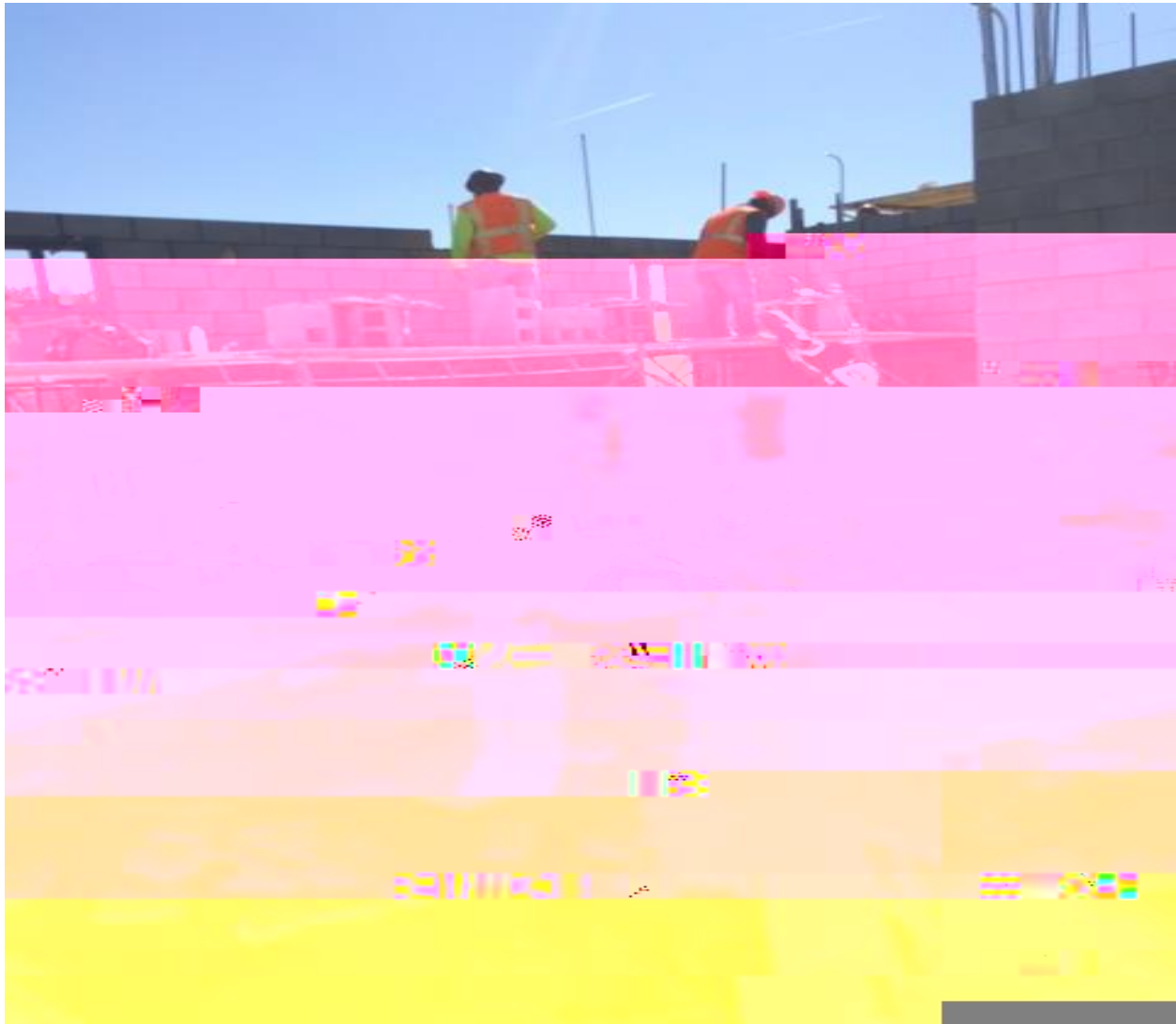
Laying up of CMU wall Area A